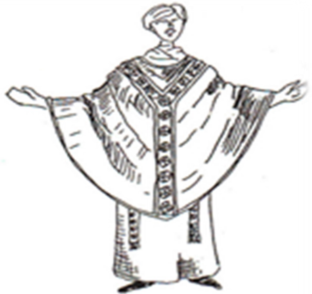
ADVENT AND LENT